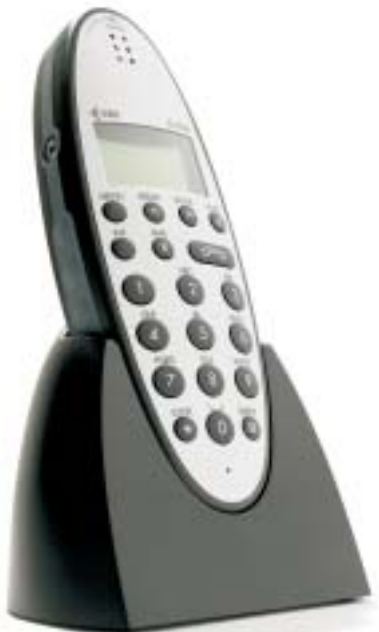
KIRK Z-4040 A classic high quality handset with a unique long list of functionalities, targeted at office, hospital, and personal security segments. IP 54 classification.