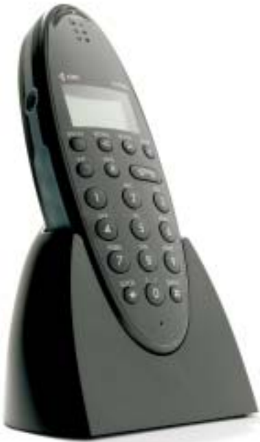
KIRK Z-4020 A high value and low cost handset fulfilling all basic requirements for a telephone. Targeted at industry, warehouse, and retail segments.