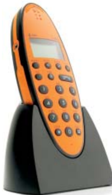
KIRK Z-4080 The ultimate handset. IP 54 and intrinsic safe classification. Targeted at explosive environments within oil, gas, and chemical production. (Launch date to be defined).