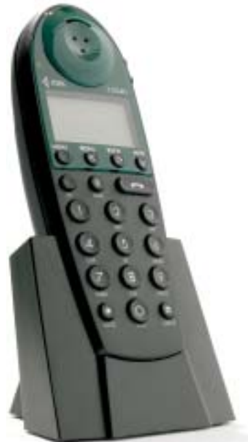
KIRK Z-3040 The classic, award winning KIRK handset. Working with the KIRK Z-3040 can be optimized using the KIRK Docking station, a desktop communication unit for hands-free operation and PC integrated telephony functions.