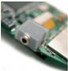
Prevention of humidity in the handset by covering the headset jack in a "rubber bag"

We believe in product evolution. New products are backwards compatible, and the earlier mentioned migration plan secures return on customers' KIRK investment. New customers benefit from our achievements made available in new products – and existing customers even more. New handsets can be used interchangeably with older handsets in the same KIRK solutions.